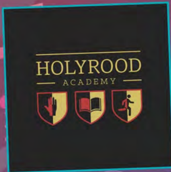
Performances from Holyrood Academy

Doors open at 7.00. The Guildhall, Fore Street, Chard, TA20 1PP